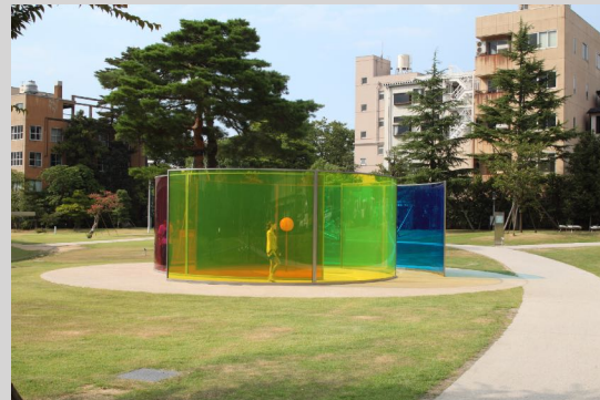
Olafur Eliasson, Colour activity house , 2010 21st Century Museum of Contemporary Art, Kanazawa

Gropius-Bau in 2010, involved interventions across Berlin as well as in the museum. Similarly, in 2011, Seu corpo da obra (Your body of work) engaged with three institutions around São Paulo—SESC Pompeia, SESC Belenzinho, and Pinacoteca do Estado de São Paulo—and spread out into the city itself. In 2014, Riverbed filled an entire wing of Denmark's Louisiana Museum of Modern Art with stones and water, emulating a river in a rocky landscape; later that year, Contact formed the inaugural exhibition at Fondation Louis Vuitton, Paris. Verklighetsmaskiner (Reality machines) , at the Moderna Museet in Stockholm in 2015, became the museum's most visited show by a living artist. In 2016, Eliasson created a series of interventions for the palace and gardens of Versailles and mounted two large-scale exhibitions: Nothingness is not nothing at all , at Long Museum, Shanghai, and The parliament of possibilities , at Leeum, Samsung Museum of Art, Seoul. Green light—An artistic workshop , created in collaboration with TBA21 (Thyssen-Bornemisza Art Contemporary), offers a response to the challenges of mass displacement and migration. Originally hosted by TBA21 in Vienna in 2016, the project was part of Viva Arte Viva, the 57th International Art Exhibition - La Biennale di Venezia, in 2017.