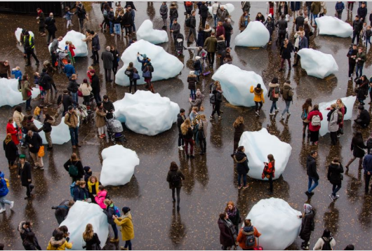
Ice Watch by Olafur Eliasson and Minik Rosing Supported by Bloomberg Installation: Bankside, outside Tate Modern, 2018 © 2018 Olafur Eliasson

Eliasson's site-specific installation Reality projector opened at the Marciano Foundation, Los Angeles, in March 2018, the same month as his solo exhibition The unspeakable openness of things at Red Brick Art Museum, Beijing. Olafur Eliasson: WASSERfarben opened at the Staatliche Graphische Sammlung in the Pinakothek der Moderne, Munich, in June 2018. In July 2019, Eliasson's In real life opened at Tate Modern, London, and, in 2020, the exhibition travelled to Guggenheim Museum Bilbao. In 2020 Eliasson also opened Symbiotic seeing at Kunsthaus Zurich.