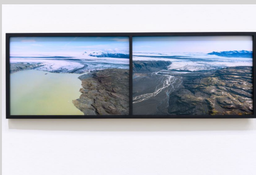
Olafur Eliasson, The glacier melt series 1999/2019 , 2019, detail Installation view: Guggenheim Museum Bilbao

In 2012, Eliasson and engineer Frederik Ottesen founded a social business, Little Sun . This global project provides clean, affordable energy to communities without access to electricity, encourages sustainable development through sales of Little Sun solar-powered lamps and chargers, and raises global awareness of the need for equal access to energy and light. < www.littlesun.com > In 2019, Eliasson was appointed Goodwill Ambassador for renewable energy and climate action by the United Nations Development Programme.