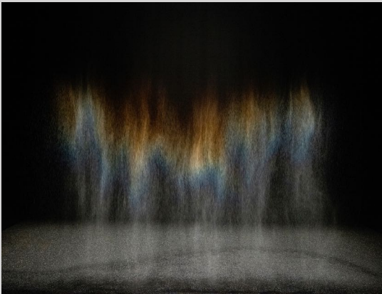
Olafur Eliasson, Beauty , 1993 Installation view: Museum of Contemporary Art, Tokyo, 2020

He lives and works in Copenhagen and Berlin.